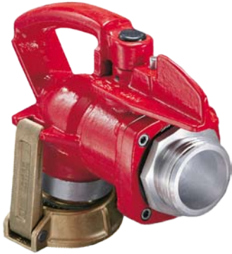
TW fuel nozzle