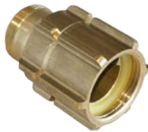
Outlet with extra long swiveling lug nut