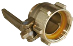
TODO-SNAP lug nut