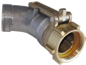
TODO-SNAP lug nut with 45° bend