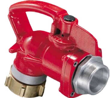
Male/female fuel nozzle