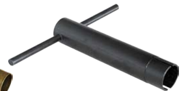
Lug nut tool