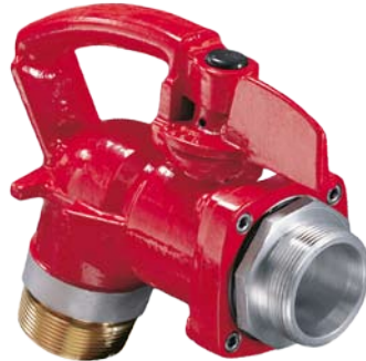
Male/male fuel nozzle